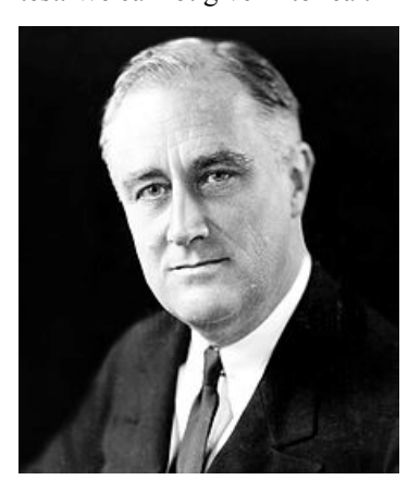
FDR in 1933

with that knowledge is the real test. We cannot give in to fear.