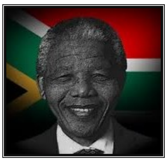
"We can change the world and make it a better place. It is in your hands to make a difference." ~Nelson Mandela

Join the Center for the Healing of Racism as we recognize Nelson Mandela International Day. In November 2009, the UN General Assembly declared 18 July "Nelson Mandela International Day" in recognition of the former South African President's contribution to the culture of peace and freedom.